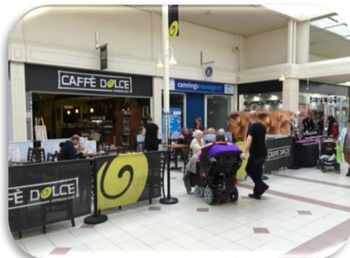
Caffè Dolce (middle of the mall, near O2)