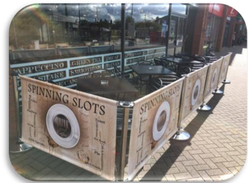
Spinning Slots (opposite bus station near Nationwide)