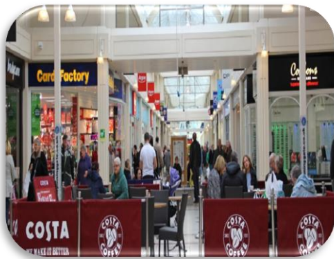
Costa Coffee (near to bus station entrance)

We have identified a number of eateries and places that you can eat