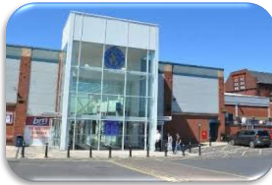
Car Park entrance