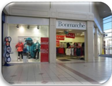
Bonmarche (Bus Station end)

To help you navigate around our shops, here are some photos of our largest stores in the centre that you can use as signposts